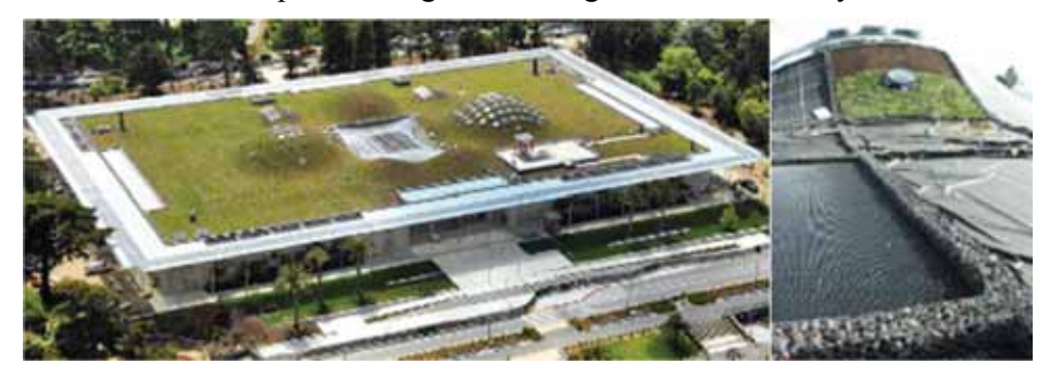
Figure 10. Green Roof in the California Academy of Sciences and its infrastructure

The Academy is designed in 2008 by the famous Piano Italian architect Renzo and constructed from recycled materials. The index features is respecting the environment and the site and the application of solar cells. Its basic design has reduced energy consumption by 30 to 35 percent. Green roofs are one of the most fundamental parts of the construction that have placed 9 native plant species in California. Plants on the roof are equipped with a thermal insulation layer. Roof has played the role of insulation and makes building warm in winter and cool in summer and prevents more than 405 million pounds of greenhouse gas emissions in a year.