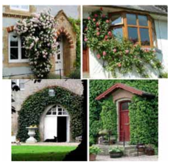
Figure 1: Left: the direct system, plants are attached directly to the wall, left indirect systems, connecting green facade by support structures

Green features could be designed and implemented by three Modular Trellis Panel system (Modular Trellis Panel system)), cable (Cable System) and Wire-Rope Net System (Wire-Rope Net System). Network Systems Modular panels, is lightweight and made of galvanized steel grid and is designed in such a way that holds the distance from the wall surface with green façade. Mesh panels, are assembled together as Modular and can cover a large surface, the panels can also be curved (Wirth, 2007)