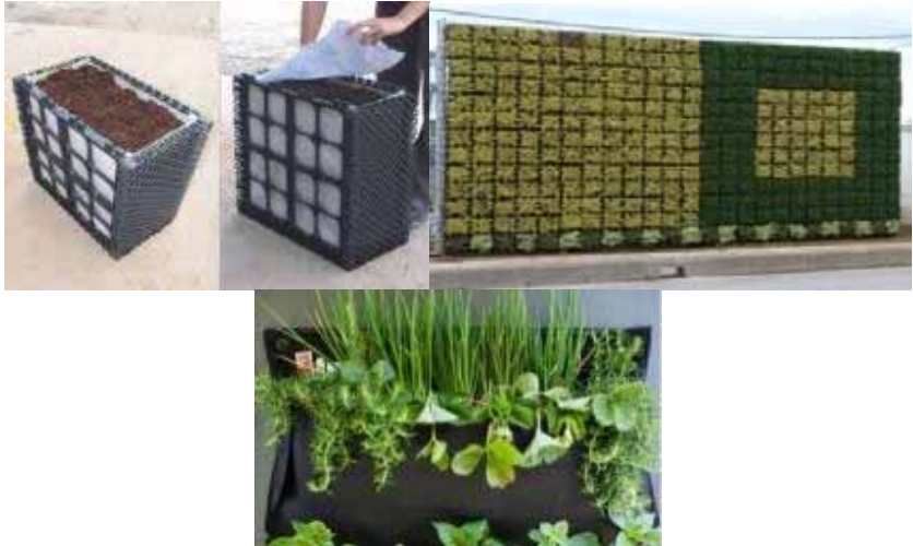
Figure 4. Modular system of living wall top system box below: Envelope systems

Living walls are a combination of panels with vegetation and those are mounted vertically by a structural lightweight system, narrowly to the building facades and are self supporting. Living wall can be used in interior and exterior of building. The walls depending on the type of pages, type of exterior and interior, have different implementation details. Living wall compared to green facade, is a more costly system and needs more maintenance in terms of irrigation and supply of additives for plants. Living walls include modular systems and industrial felt. The modular system is a chamber filled with growing medium attached to the wall that different types of it are box and the envelope system. Box systems, are modules that are placed as place of plant growth in metal support frame and has the ability to separate from the wall or replaced to change the model. Each module contains a bag of soil in which the lightweight plants have already been planted in the greenhouse and irrigation system is drip. Envelope systems including gardening container, having a moisture barrier is flexible.