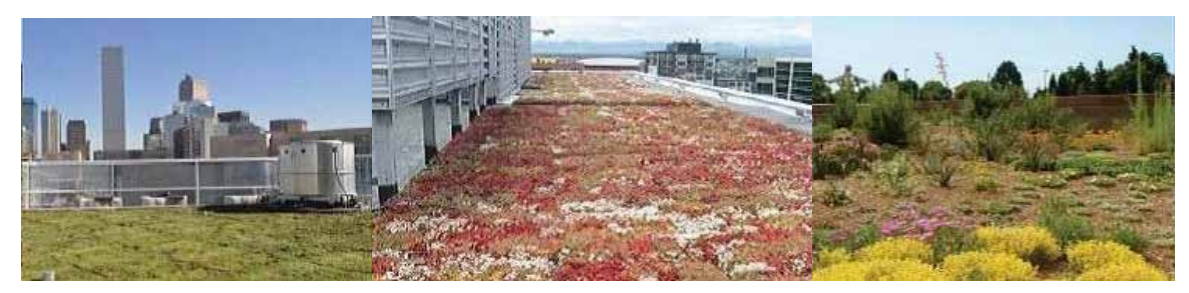
Figure 9. Types of extensive green roof, from left to right: modular trays, interlocking modular system, weakened.

Green roof based on average depth of planting and its facilities is divided into both centralized and extensive green roof. Centralized or intensive green roof (intensive), due to the lack of restrictions on planting depth layer covers a variety of plant species that can be considered as a recreational space, this type of roof gardens require watering, fertilizing, pruning and other care.