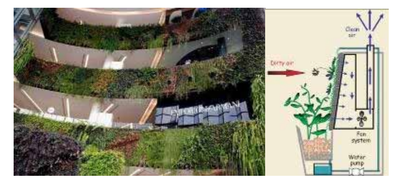
Figure 6. Active living walls

walls of the living system, in the most cases seedbed is as plant maintenance and, food is available for plants by the irrigation system. Planting bed depending on the type of plant and details on system performance in relation with depth is different and irrigation system of living walls is usually dripped. Active living wall (Active Living Wall), is one of the newest types of green walls with integration is used in heating, cooling and ventilation of the building. The system purifies indoor air and also acts as a thermal regulator. The herb absorb monoxide and carbon dioxide and can remove particulate matter in the air and natural processes of plants produce, fresh air that is drawn into the system through a vent and then led into the building