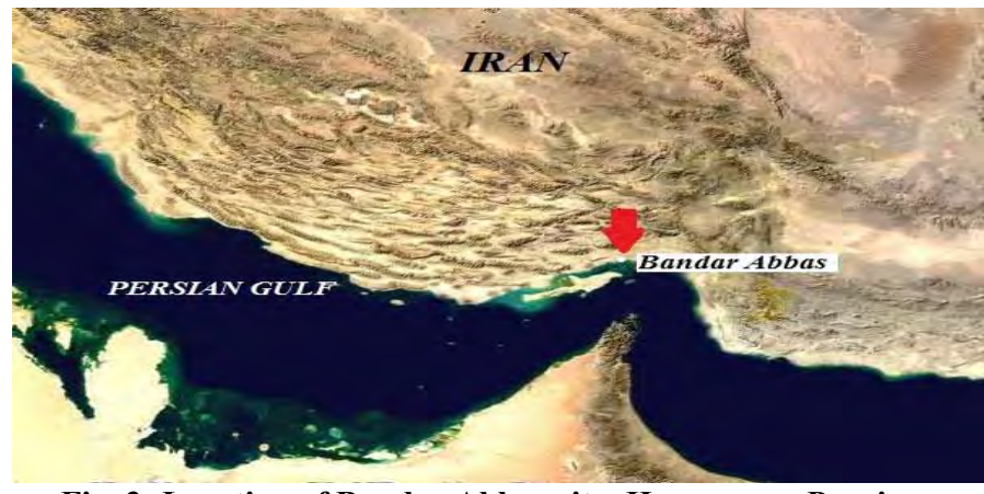
Fig. 3: Location of Bandar Abbas city, Hormozgan Province

Located near the Persian Gulf coast, Bandar Abbas is approximately 45 km2 and its height is 10 meters above sea level. Save for a limited part of its northern section, especially in its northeastern regions that are uneven, the rest area of Bandar Abbas city that is expanded along the sea line is almost even. Naturally, the height of the lower edge of the coast is in its lowest amount, and, as it moves northward, its height from the surface of free waters is increased.