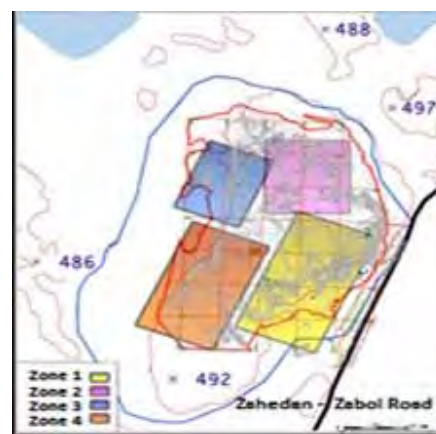
Figure 3: Zoning based on the formation of cities, similar spaces and deploying the applications during development (author, 2013).