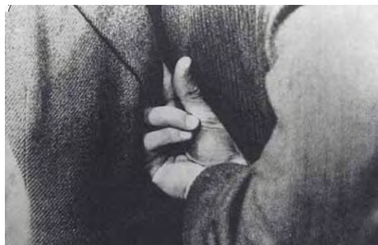
Figure 5. Deleuze’s emphasis on haptic function of hands in Robert Bresson's Pickpocket (Dalle Vacche, 2003, 5).