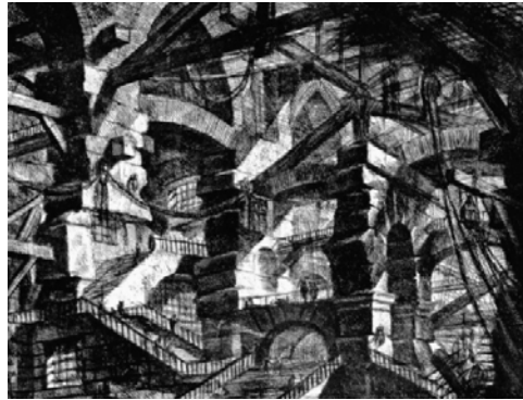
Figure 2. Collapse of homogenous perspectival space in Piranesi's designs (Hannah, 2008, 391).

suspense. He asks: “Why should not the cinema be entitled to effect such transfers?” (Kracauer, 1997, 87). Sergei Eisenstein (Eisenstein, 1990), Russian filmmaker and theoretician, who considered cinema eligible for this kind of transformation, borrowed the idea of “ecstatic transfiguration” from Piranesi.