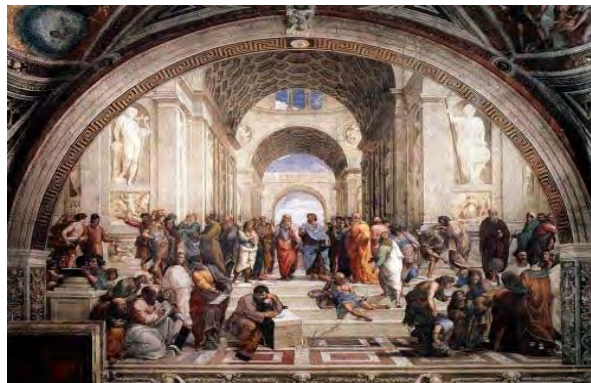
Figure 4. Establishing and approving spectator’s perspectival position in optical representations (Gardner, 200, 428).