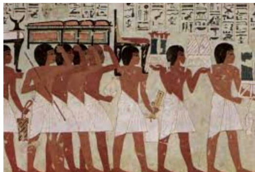
Figure 3. Flowing on the surface instead of moving into depth in haptic representations (Goshayesh, 2000, 31).

regarding rhizome, they stress that rhizome “is an extraordinarily fine topology that relies not on points or objects but rather on haecceities, on sets of relations... It is a tactile space, or rather haptic, a sonorous much more than a visual space” (Deleuze & Guattari, 2005, 382). This smooth haptic space has huge capacity for deterritorialization, Deleuze’s favorite concept. Deleuze also used this term concerning Robert Bresson's film Pickpocket . Deleuze mentions spatial connecting function of hands in Pickpocket that causes the spectator’s eye “doubles its optical function by a specifically 'grabbing' [haptique] one, if we follow Riegl's formula for indicating a touching which is specific to the gaze” (Deleuze, 2005, 12) (figure 5).