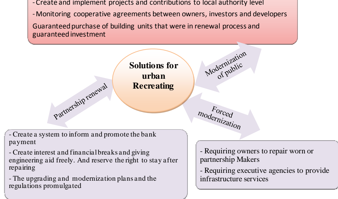
Figure 1: Solutions for recreation and improvement of urban worn parts