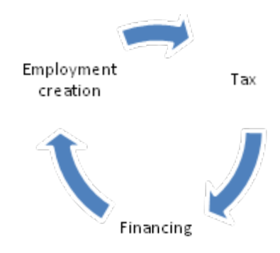
Figure 1. Employment creation cycle, tax and financing