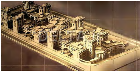
Fig 1. Residential complex URL:1

In Iran, it has been some years that Optimization of fuel consumption [affiliated to the Ministry] has set rules for saving energy in all economic area, especially in construction (Bahari Nejad and Safarzade, 2002). Construction and housing are the biggest energy consumers (40%). Not only do residential and commercial buildings have high portion in energy consumption, but energy consumption in comparison with other countries and international standards is highly noticeable. The average energy consumption of buildings in the 58/2 times the average world consumption (Nasrolahi, 2010).