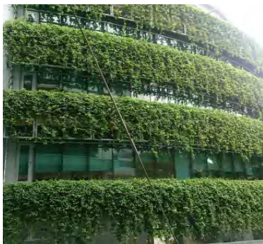
Fig 5.Green Facade URL:3

More respects for human beings' demands and workforce can be experienced in two different ways. It is necessary for professional constructors to note that the materials and processes that shape the health and safety of building are important for workers or users to the extent that it is important for the whole society. Architects gradually notice dangerous materials in building and recently are using insulated material contained CFC or harmful subjects are forbidden.