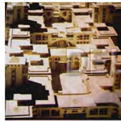
Fig 2. Zeytoon residential complex URL:1