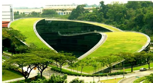
Fig 6. Green Roof URL:2