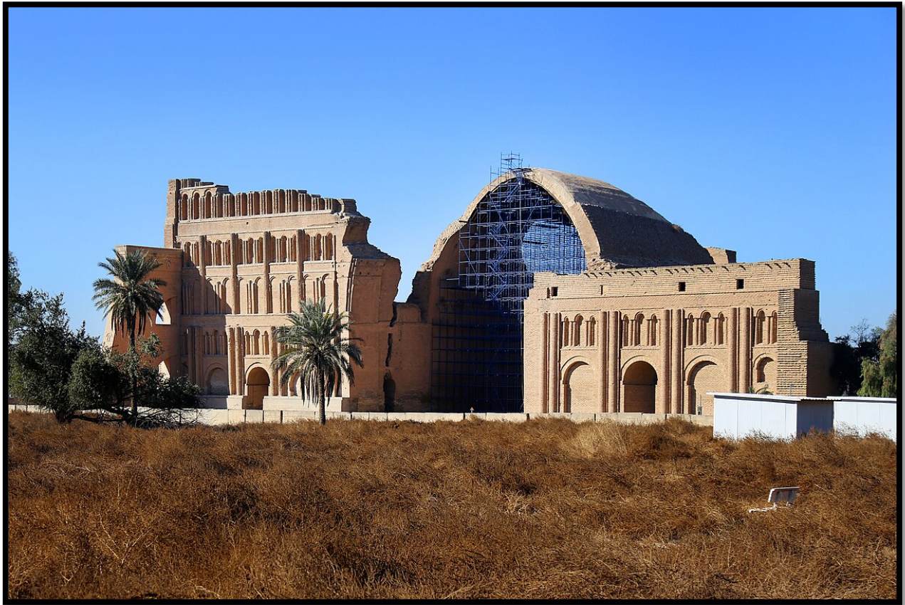
Figure 2. Tagh-e Kasra or Ivan-e Kasra

It should be mentioned that the key feature of Parthian architecture was the ivan , an audience hall supported by arches or barrel vaults and open on one side. The use of the barrel vault replaced the Hellenic use of columns to support roofs. Although the ivan was known during the Achaemenid period (550 BC – 530 BC) and earlier in smaller and subterranean structures, it was the Parthians who first built them on a monumental scale. The researchers have found the earliest Parthian ivans at Seleucia, which are attributed to the early 1st century AD. Monumental ivans are also commonly found in the ancient temples of Hatra and may be modeled on the Parthian style.