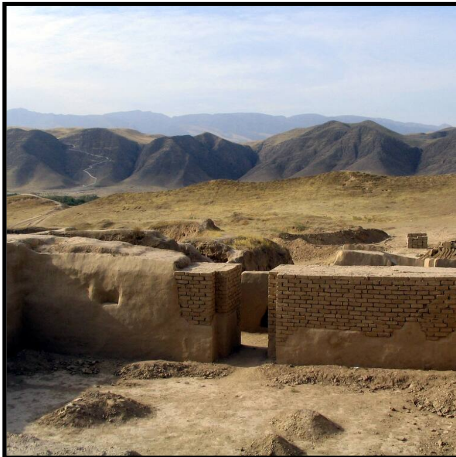
Figure 1. A part of ancient site of Nisa Fortress

The notable city of Nisa (founded by Arsaces I, 247 BC–211 BC), which was reputedly the royal necropolis of the Parthian kings and served as an early capital, was crucial for trade and administration. Its ruins, featuring impressive fortifications and temples, reflect its strategic importance in the Parthian realm. Excavations at Nisa have revealed substantial buildings, many carved inscriptions, rock reliefs, ceramics and stucco works, frescos, an expressive treasury (jewellery items, coins), and Hellenistic art works. One fascinating aspect of Nisa is its impressive architectural remains, including the Fortress of Nisa, which features well-preserved mud-brick structures and a complex of temples. The site is notable for its unique blending of Greek and Persian influences, visible in its art and architecture. Another intriguing feature is the discovery of a large number of clay tablets inscribed with cuneiform script, shedding light on administrative practices and trade. Nisa also played a vital role in the Silk Road network, facilitating trade between the East and West. In fact, almost all the art and architecture at Nisa manifest a great intermingling of Western and Iranian styles.