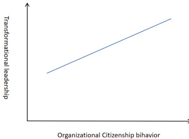
Chart 1. The mediating effect of organizational citizenship behavior on employee burnout

To further examine the moderated mediating effect, Mplus 7 was used. When conducting a Bootstrap test, it was found that when organizational citizenship behavior increased from distance mean -1 unit to distance mean+1 unit, the mediating effect of employee burnout decreased, and the corresponding confidence interval contained zero. The indirect effect changed from significant to insignificant, indicating the mediating effect of organizational citizenship behavior between transformational leadership and employee burnout. Hypothesis H3b was validated.