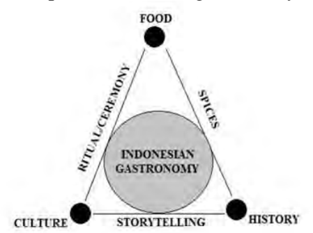
Figure 1. Triangle Concept of Indonesian Gastronomy

Lecture material is designed with a focus on the learning outcomes to be achieved. In preparing the questionnaire for the Gastronomy Nusantara lecture material, guided by the Triangle Concept, a gastronomic philosophy based on three triangular stoves. The three are, food, culture and history. Here's a picture of the concept of Indonesian gastronomy: