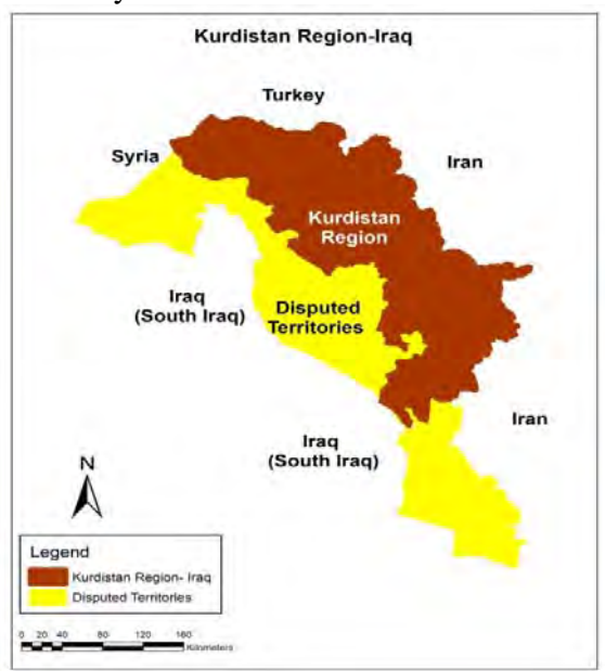
Figure 1. Map of Kurdistan Region of Iraq

Kurdistan Region-Iraq is an autonomous territory, situated in the north of Iraq. See Figure 1. The size of Kurdistan region-Iraq is about 41,000 square kilometers (KRG, 2019). It is bigger than the Netherlands. It mainly covered by the mountains in the North East and North.