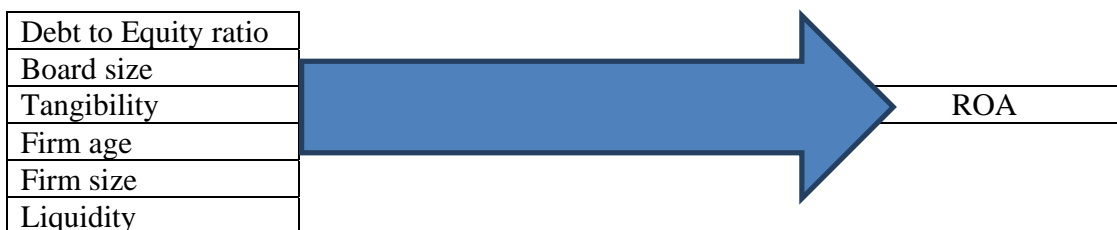
Figure 1 Theoretical framework

The companies with better liquidity are supposed to pay better dividends. The company with better liquidity normally does not face the problem of overtrading and similarly it does not face the problem of under capitalization. They invest the excess cash in the right options and can manage better source of financing if it face the problem of short of cash. So under this context one can also draw this hypothesis that the company's liquidity has positive impact on dividend payout ratio. Because the companies with better liquidity position do not face liquidity problems and can pay dividends to the shareholders.