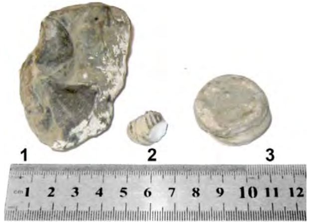
Figure 2. Prints castle without castle brahiopody argillite clastic sediments at the foot of the mountain Zhuantobe:1- Chonetes corboni f erus; 2- Curthospiriferdisjunctus; 3- prints brachiopods.

If terrigenous sediments are preserved prints of external forms of extinct organisms, they are called the fingerprints of the outer core of the body. If prints are stored internal parts they are called prints the inner core of the body [table 3].