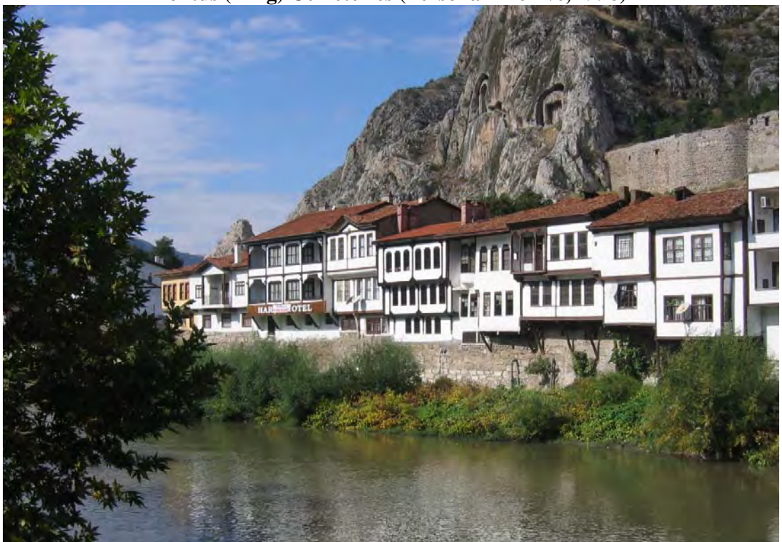
Figure 6. Riverside Houses