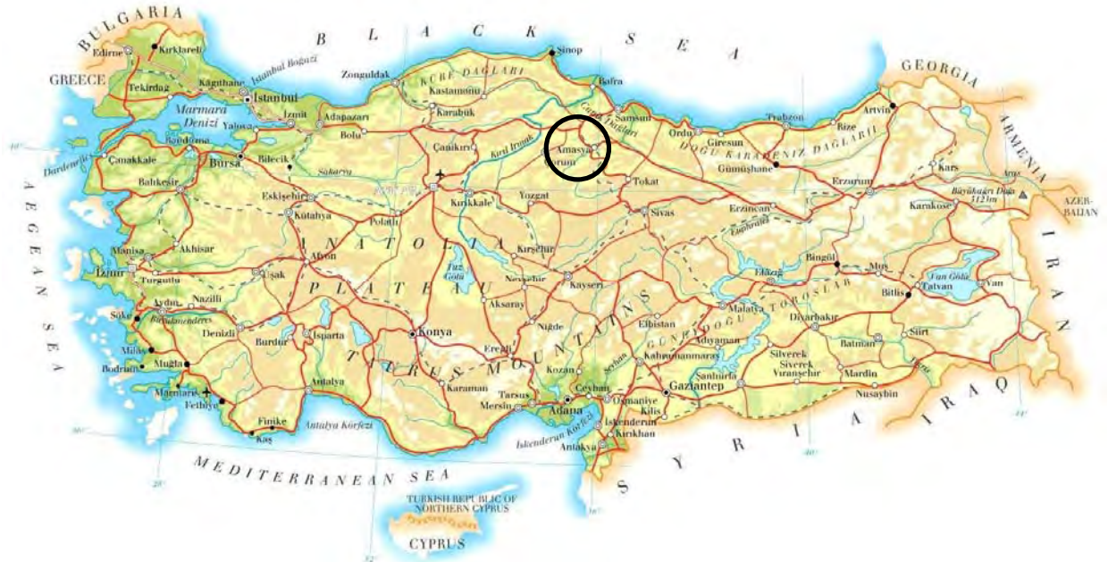
Figure 1. The Location of Amasya in Turkey (URL 1)