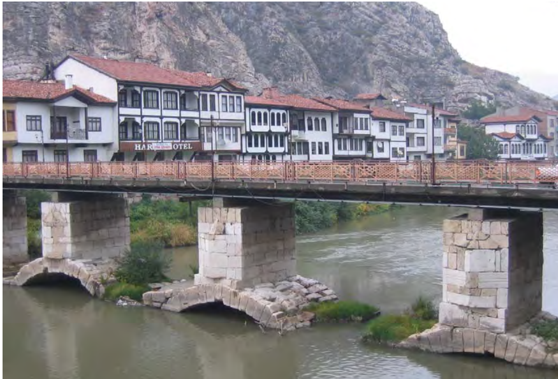
Figure 7. Riverside Houses and Alcak Bridge (Roman Era)

The other local organization, which is very important for the conservation of historical and cultural fabric, is the Foundation for the Conservation of Cultural and Natural Assets (AKTAV) in Amasya. The purpose of the Foundation, established in 1996, is specified under the Foundation's establishment deed;