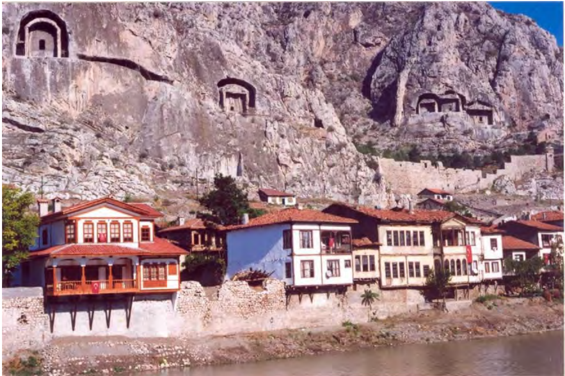
Figure 5. The Main Components of Urban Identity; Topography, River, Riverside Houses and Pontus (King) Cemeteries (Personal Archive, 1998)