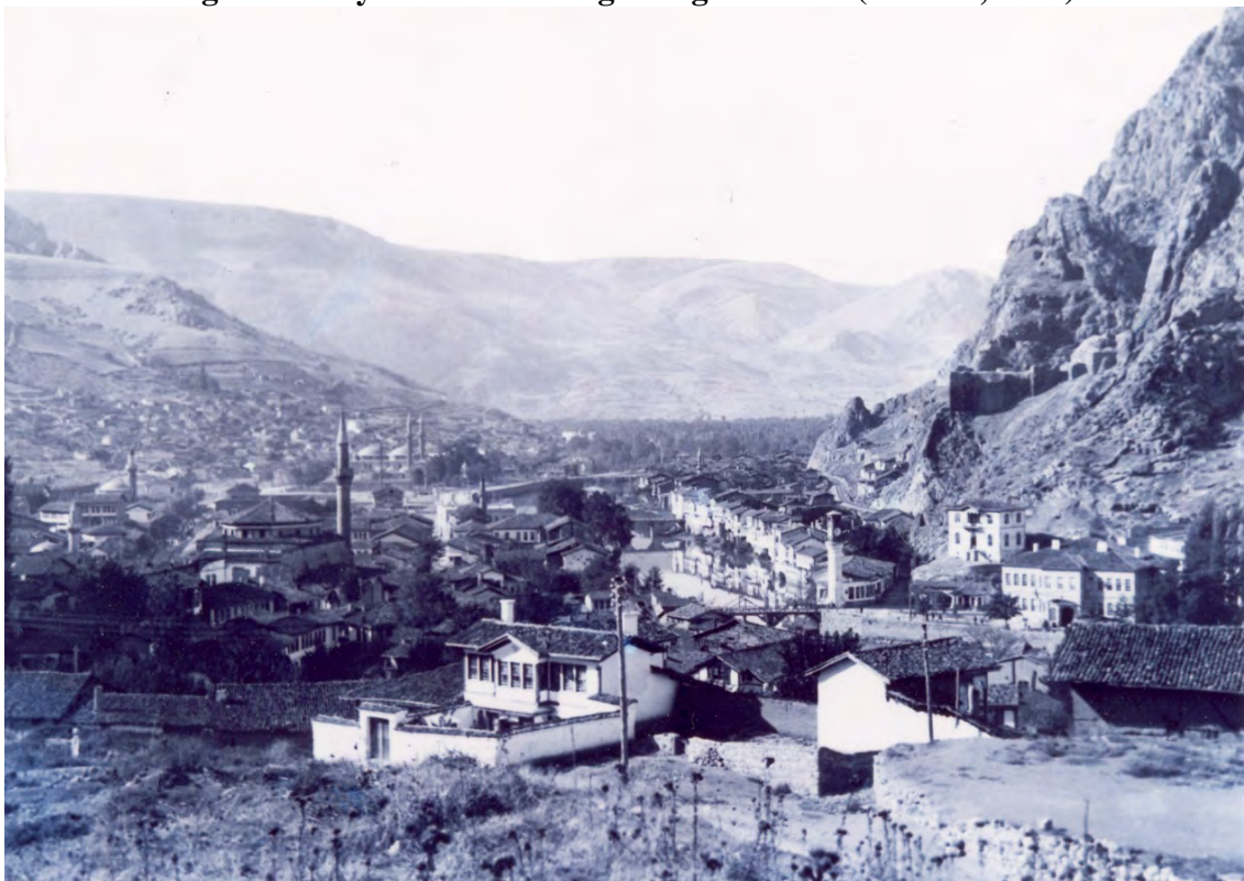
Figure 4. Panoramic View of Amasya in 1934