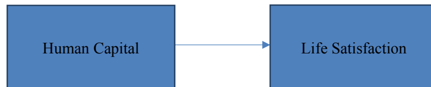
Fig 3: Effect of Human Capital on Life Satisfaction

X 1 = Independent Variable (Human Capital)