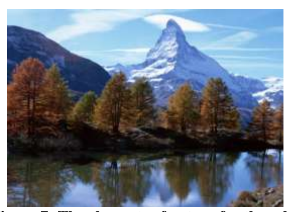
Figure 7: The elements of nature for thought

Some other elements such as mountains, sky and whatever are in it (moon, sun and stars) not only do they have materialistic bless, also they can help think deeply and determine time (figure 7) place and orientation (Naghizadeh, 1999).