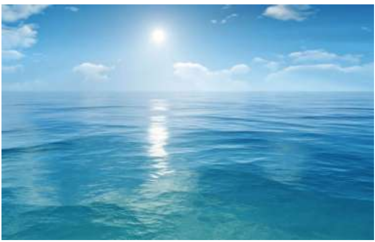
Figure 3: Water