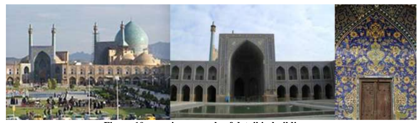
Figure 10: a review on scale of detail in building