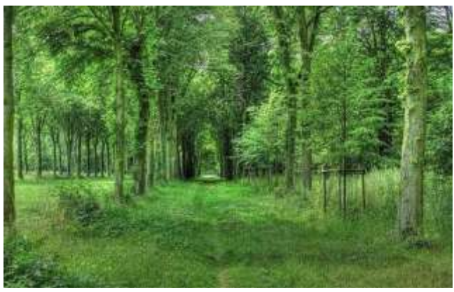
Figure 5: Plants symbols of paradise