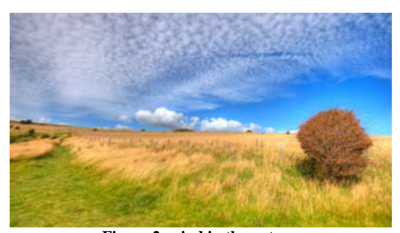
Figure 2: wind in the nature

Wind plays an important role in continuation of life among many creatures on earth and help adjust the climatic condition, transporting the pollution, insemination of plants, enunciation of mercy of the supreme being (Al-Furqan: 48 and An-Naml: 63) a divine symbol (Ar-Roum: 46) and also eternal suffering (Adh-Dhariyat: 41, Al-Ahzab: 9, and Al-Ahqaf: 24).