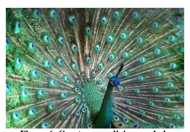
Figure 6: Creatures as divine symbols

Different kinds of animals are divine symbols that deliberation on their creations and the quality of their life can lead human to submitted principles in Islamic teachings (Naghizadeh, 1990). (Figure 6)