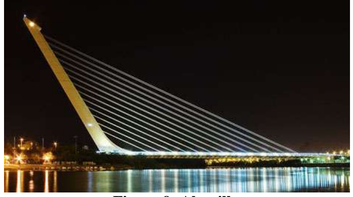
Figure 9: Alamillo

During blowing, trees bend and save some wind energy to potential energy and in back and forth movement, empty it in reverse direction. The arrangements of branches are in such a way that weight in one side can hold the other side and vice versa. It can be seen in the Alamillo Bridge designed by Santiago Calatrava. In its designing, the opening and mast are in stability and the combination of aesthetics principles are applied. These two structural elements are asymmetrical (figure 8).