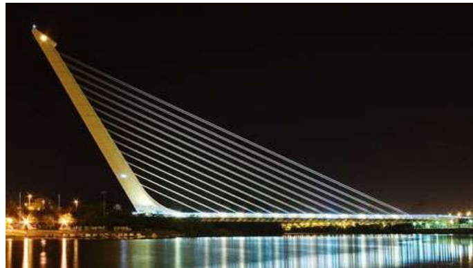
Figure 9: Alamillo

During blowing, trees bend and save some wind energy to potential energy and in back and forth movement, empty it in reverse direction. The arrangements of branches are in such a way that weight in one side can hold the other side and vice versa. It can be seen in the Alamillo Bridge designed by Santiago Calatrava. In its designing, the opening and mast are in stability and the combination of aesthetics principles are applied. These two structural elements are asymmetrical (figure 8).