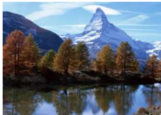
Figure 7: The elements of nature for thought

Some other elements such as mountains, sky and whatever are in it (moon, sun and stars) not only do they have materialistic bless, also they can help think deeply and determine time (figure 7) place and orientation (Naghizadeh, 1999).