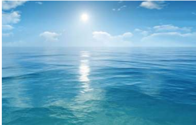
Figure 3: Water