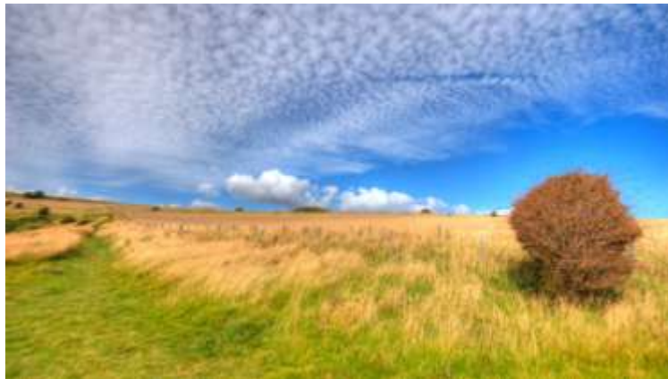
Figure 2: wind in the nature

Wind plays an important role in continuation of life among many creatures on earth and help adjust the climatic condition, transporting the pollution, insemination of plants, enunciation of mercy of the supreme being (Al-Furqan: 48 and An-Naml: 63) a divine symbol (Ar-Roum: 46) and also eternal suffering (Adh-Dhariyat: 41, Al-Ahzab: 9, and Al-Ahqaf: 24).