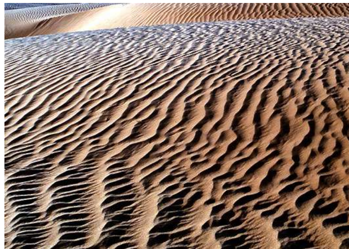
Figure 4: Soil

Soil as the first material for creating man (Al-An'am: 2, Al-Mu'minoon: 12, As-Saffat: 11, As-Sajda: 7 and An-Naml: 63). Also, soil is the final place of man's body and is filled by elements that almost have all materialistic demands inside (figure 4). On the other hand, in some important issues such as cleanliness and purity, water can replace with soil and help man prepare for praying. Soil is a place for worship (Imam Khomeini, 1999).