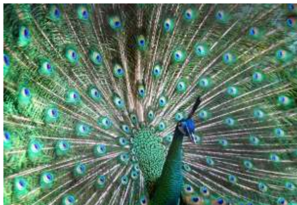
Figure 6: Creatures as divine symbols

Different kinds of animals are divine symbols that deliberation on their creations and the quality of their life can lead human to submitted principles in Islamic teachings (Naghizadeh, 1990). (Figure 6)