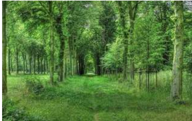
Figure 5: Plants symbols of paradise