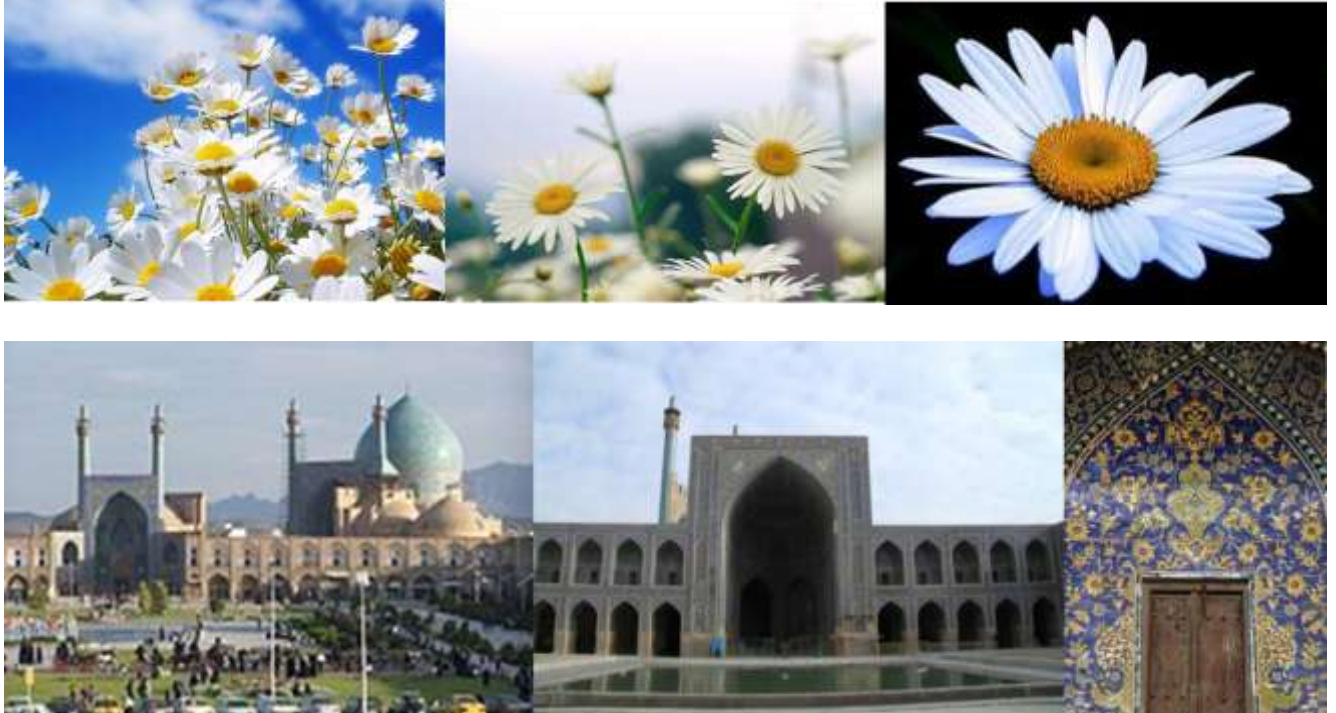
Figure 10: a review on scale of detail in building

Nature contains all elements with precise details and it is regardless the size of surface. When a flower is observed closely, more details are seen. In architecture, buildings can be perceived in diverse distances, a step further shows detailed elevation and materials. Architectural elevations with no details are boring (figure 9).