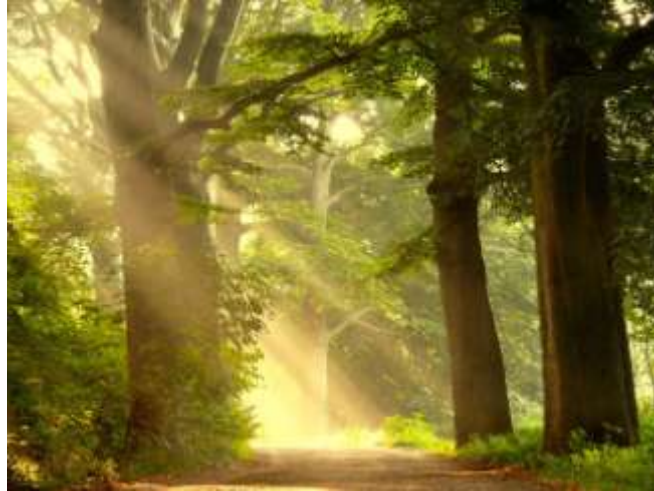
Figure 1: light in the nature