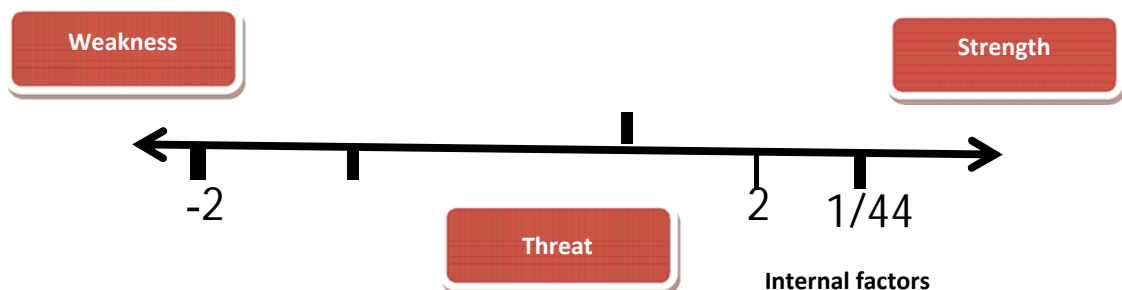
Figure 2. SWOT matrix of Birjand economy