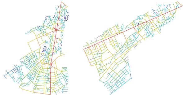
Figure 4. Axial maps extracted from the street map of region A(left), and the region B(right)

show the pedestrians and rider's access space. The information related to spatial variables, shown in tables 1 and 2, indicate that the average of integration values, connectivity and local integration are higher in region A. Tables(2) and (3) show the differences in street configuration of the regions.