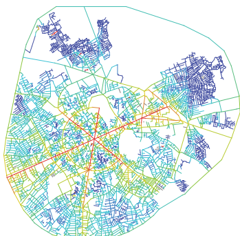
Figure 3. The axial map extracted from the Hamedan city street map

Space syntax, in its ambition, is a way to the understanding of the complex effects, on the horizontally distributed social body of the city, of its physical infrastructural movement network (Read:2005). In this research, the configuration of the streets in both regions were studied and all areas of city between the first and second Hamedan city ring were analyzed in terms of space syntax by Depth Map software. All the spatial criteria of integration, connectivity, control and legibility were extracted by the software.