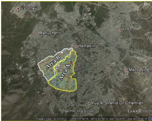
Figure 2. The situation of two cases of study within the Hamedan city

Hamedan is one of the first settlement of Arian people in Iran plateau and first capital of Iran. The design of Hamedan was first introduced by Karl Frisch (1932) based on concentric circles.