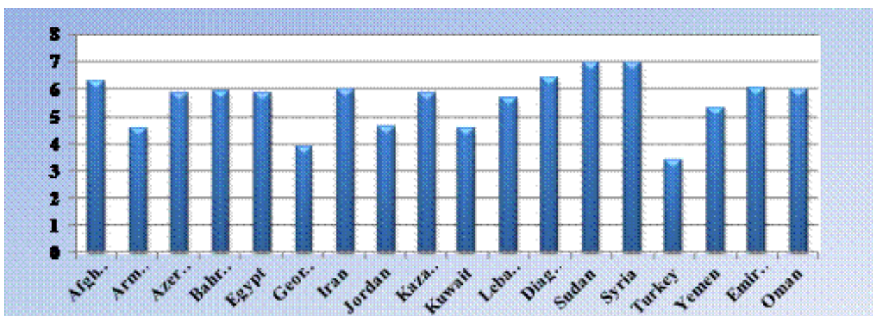
Chart 2. Analysis the trend of non-weighted average of political rights index in selected Middle East countries.

Furthermore; according to chart (3), the following can be concluded: