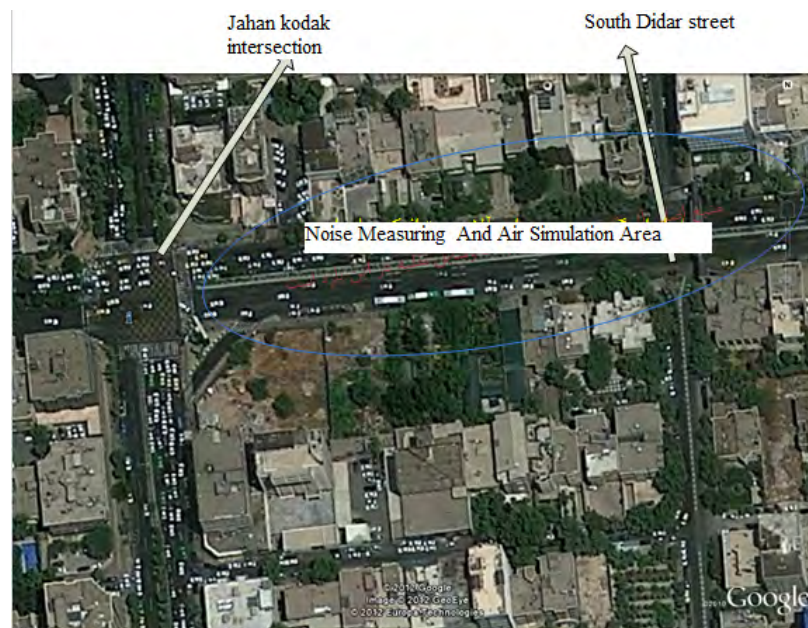
Figure 2: Map location

Considering what was said above, this study area was considered for investigating traffic changes and for estimating the levels of noise and air pollution. A preferred location for measuring noise pollution is observed in Figure 3.