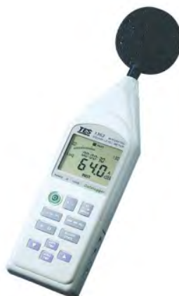
Figure 1: Example of noise

Noise measuring was done for a week with using of sound level meter and in four points in two times of day (morning and evening). Noise is measured in units of decibels. The measuring device can be seen in Figure 1.