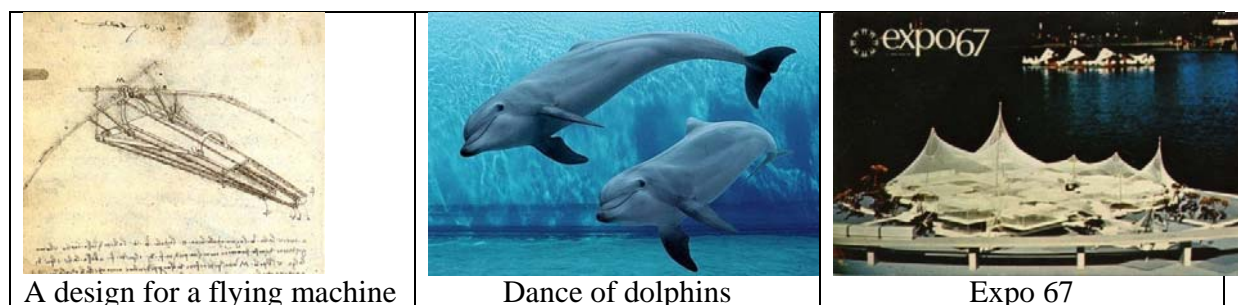
Figure 2. Sample of Bionic Architecture

From the very first, human being was inspired by nature and environment. For example, Leonardo da Vinci, was stimulated by the body of bats in order to make flying machine and the high-speed dolphins were good sources for submarine and even spider’s web was applied for Montreal expo by Frei Otto, the German architect (URL : 35).