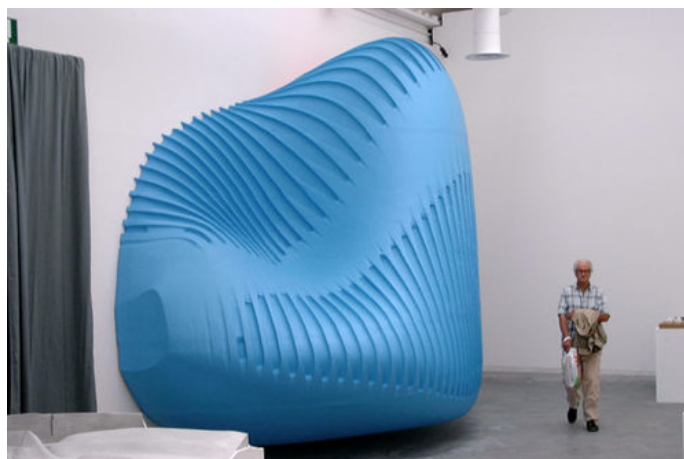
Figure 3. Embryological House

One of the famous works of him is Embryological House. In this concept, he is dealing with diversity, flexibility mass production. In this house, geometrical regulations have been defined perfectly and it proves that proportion, aesthetic, functions in its classic definition are valuable. Not only, does Embryological House influence by preliminary data, also it adapts itself with common local style, climatic condition and material. (Rajabifar, 2009, 97)