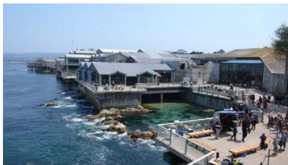
Figure 1. Monterey aquarium

Bionic facilities such as public aquariums are aimed to be used as recreational and entertainment centers. Places like aquarium, museums and can attract visitors' attention. For an example, some of the aquariums such as Monterey aquarium have low depth tank, filled with the variety of fish that can be felt and seen while people passing the tank.