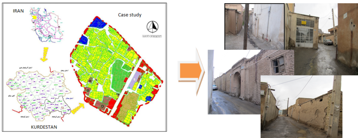
Figure 2: the situation of the Ghaleach Chaharlan neighborhood (Organic context) (reference: the entailed design of Sanandaj, 2009).

Ghaleach Chaharlan neighborhood is in the 1 st region of Sanadaj; area 3 and 4 and neighborhood 3 and 4. In figure1, the situation of the considered limitation is shown.