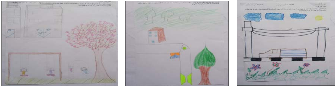
Figure 3: Ghaleaeh Chaharlan neighborhood's children's needs demands from urban spaces (reference: the writers)

Finding shows testing the hypotheses that the linear Regression test and the t-test student were used, for testing the hypotheses.