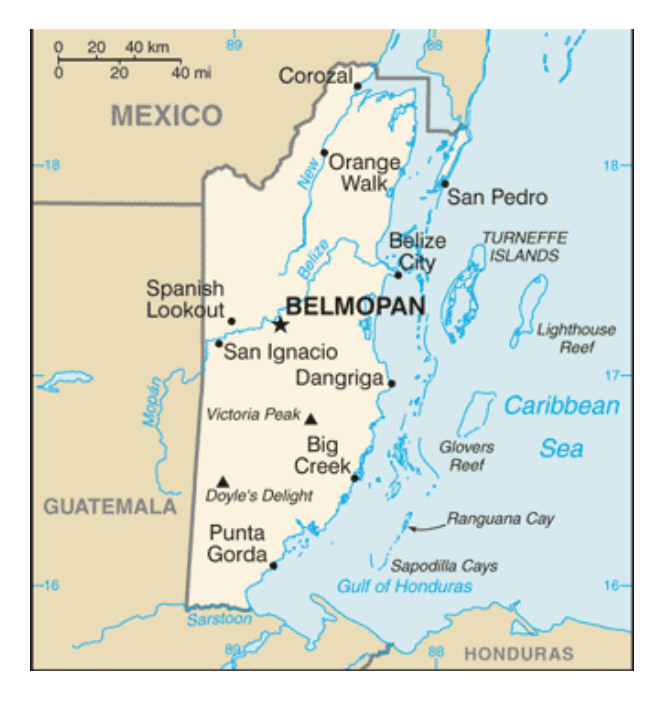
Figure 2. Map of Belize.