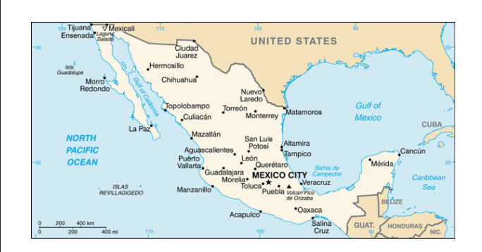
Figure 7. Map of the United Mexican States.

The United Mexican States gained its independence from Spain in 1821. It has an area of 1,964,375Km<sup>2</sup> and its map is presented in Figure 7. Towards the end of the nineteenth century Muslims emigrated from Syria. Based on census data as shown in Table 6, the Muslim population increased from 162 in 1895, to 602 in 1910, to 1,421 in 2000, to 3,760 in 2010, but still constitutes 0.00% of the Mexican population. Thus, assuming that the percentage of Muslims will increase by 0.01 of a percentage point every half century; then the Muslim population is expected to reach 13,000 or 0.01% in 2020, then 14,000 or 0.01% by 2050, and 25,000 or 0.02% by 2100.