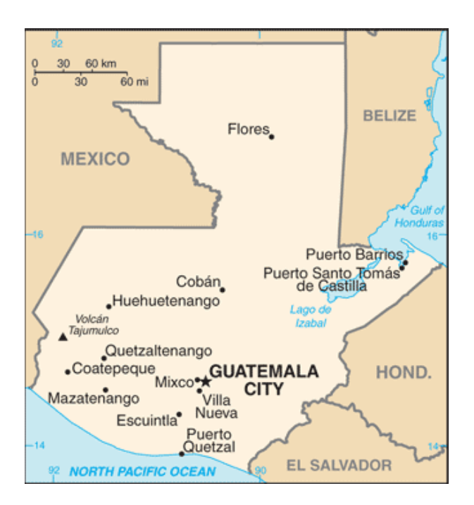
Figure 5. Map of the Republic of Guatemala.