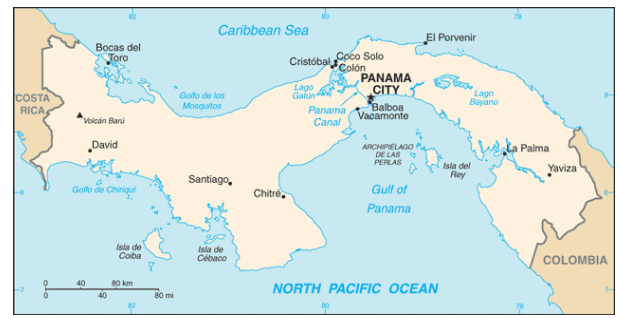
Figure 9. Map of the Republic of Panama.

The Republic of Panama gained its independence from Columbia in 1903. It has an area of 75,420Km2 and its map is presented in Figure 9. The first Muslims in Panama were Chinese workers who were brought for building the Panama Canal between 1904 and 1914. They were then followed by Palestinians after the middle of the twentieth century. Thus, estimates for the Muslim population increased none in 1904, to twenty of 0.01% in 1911, to 500 or 0.04% in 1970, to 1,000 or 0.05% in 1980, to 5,000 or 0.18% in 2000, to 10,000 or 0.29% in 2010. Thus, assuming that the percentage of Muslims will increase by 0.05 of a percentage point per decade; then the Muslim population is expected to reach 14,000 or 0.4% in 2020, then 26,000 or 0.5% by 2050, and 39,000 or 0.8% by 2100. The data are summarized in Table 8.