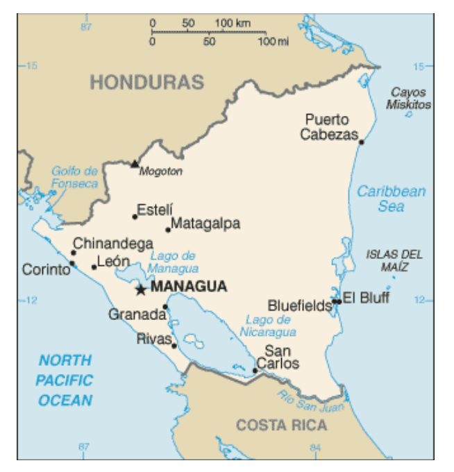
Figure 8. Map of the Republic of Nicaragua.

The Republic of Nicaragua gained its independence from Spain in 1821. It has an area of 130,370 Km<sup>2</sup> and its map is presented in Figure 8. The first Muslims came from Palestine. Estimates of Muslims increased from ten in 1906, to 150 or 0.01% in 1971, to 500 or 0.01% in 1995. According to the 2005 census, the Muslim population increased to 321 or 0.01%. Thus, assuming that the percentage of Muslims will increase by 0.01 of a percentage point per decade; then the Muslim population is expected to reach 1,400 or 0.02% in 2020, then 4,000 or 0.05% by 2050, and 7,300 or 0.10% by 2100. The data are summarized in Table 7.