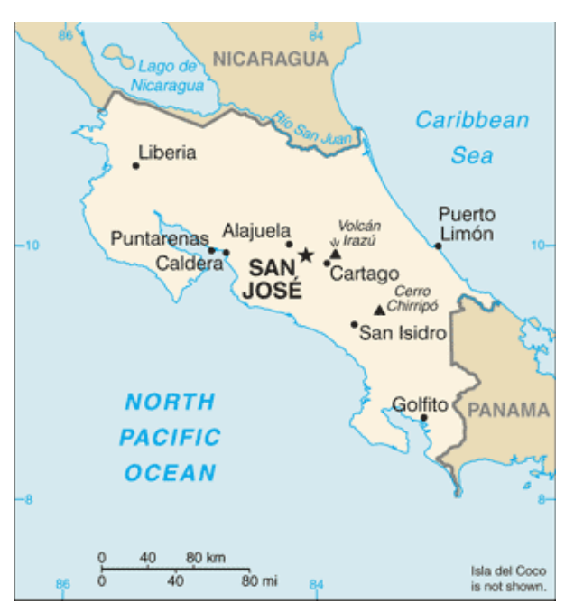
Figure 3. Map of the Republic of Costa Rica.

The Republic of Costa Rica gained its independence from Spain in 1821. It has an area of 51,100Km<sup>2</sup> and its map is presented in Figure 3. First Muslims came from Palestine in early twentieth century. As shown in Table 2, estimates for the Muslim population increased from none in 1908, to 100 or 0.01% in 1973, to 500 or 0.01% in 2000 or 2011, but remain at 0.01% of the total population since 1970s. Thus, assuming that the percentage of Muslims will increase by 0.01 of a percentage points per decade, then the Muslim population is expected to reach 1,100 or 0.02% in 2020, then 3,000 or 0.05% by 2050, and 5,000 or 0.10% by 2100.