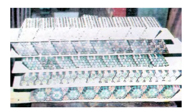
Figure 12. Five types of Luz Khatam are sliced and putted near each other before gluing and putting under the press.

After Luz formation that is in the form of the long and narrow column with rhombic shape cross section, the column cutting stage becomes complicate about 6 to 8 pieces then these pieces are collected near each other and glued. In the next step, two thin wooden plates are attached under and over the rhombic and two pieces of wood are putted at both ends and first of last rhombic and then are pressed (Figure 12).