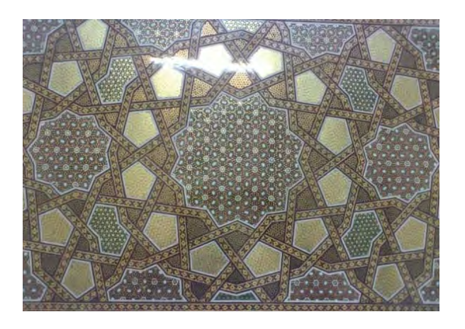
Figure 8. Khatam board with node motif "Shamse Kand 12" in the name of thousand suns.

The utilized motifs: Khatam motif from the smallest shape to the final collection of intended Khatam indicates one or hundreds of nodes or geometric motif. "It can be claimed that the art of Khatam originated from node and Chinese node. Chinese node is a term that is used to the art and different stages of drawing and executing of each node. Each node typically consists of a polygon geometric shape that depending on the taste of the artist and its application has different simplicity and complexity. "(Ibid., 186) (Figure 8)