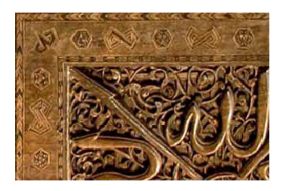
Figure 2. The upper part of the Holy book in which hexagonal Khatam flowers are seen

Perhaps the first sample of Khatam which was found in Iran refers to the single flowers applied in the Holy book, which belongs to the 8<sup>th</sup> century (simultaneous to the patriarch of Mongol government in Iran). In the Holy book, small Khatam is exhibited in the form of a hexagon "The name of the manufacturer of the Quran indicates that this object is made in Iran" (Demand, Ibid: 123) (Figure 2 & 3). After that time, Khatam art can be seen in Iran and countries like Syria and Egypt.