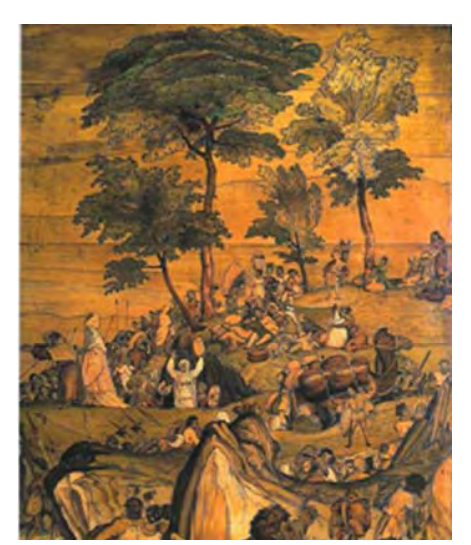
Figure 14. A sample of marquetry in 16 century in Italy