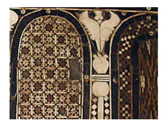
Figure 1. A part of the board which is worked by Egyptian Inlay and Khatam in which purring white beads on the chess part of right side indicates the Inlay art and carving a page under the arch of the left side shows the Khatam art. Metropolitan Museum

mainland of Khatam art and some other Indians and some other know Egyptians and Syrians as its origin and each of them offer documents to prove his claim. In Handbook of Islamic Industries, Demand attract readers' attention to the differences between Inlay and Khatam art and explains that: "Khatam and Inlay have been popular at all eras in the Muslim world both in the East and west" (Demand, 1986: 132). In this regard, he refers to the wooden piece which is decorated by these two arts namely Inlay and Khatam in the second century AD in Egypt. (Figure 1)