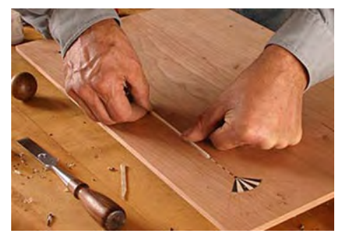
Figure 21. Inserting a long wooden piece in the vacated part of the table's surface

At this stage, according to the explanations that were provided on Khatam, inlay and marquetry arts, the differences which separate them from each other can be discerned between them. For example, in both scrimshaw and woodturning arts, wood carving is the main factor of works making and common point of both arts with each other, while their carving method, conversely, is the main point to recognize and differentiate them. This differentiation is to somewhat that woodturning art never is considered similar to the scrimshaw art.