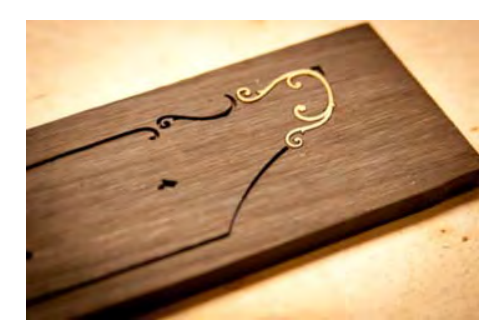
Figure 20. Incomplete Inlay

Features of inlay: Due to the common use of the above meanings that clarify its properties, it can be concluded that without any exceptions use of the interpretation of the inserting pieces in the context of work. And, the infinity of genus of surfaces and materials used inside the surfaces of inlay like wood, metal, stone, etc., dependent upon being solid and hard surface. Finally, the interpretation of a kind of decoration for this art without specifying the decorative design, size and shape of parts. Inserting separate pieces one by one inside the vacated context. (Figures 20-21)