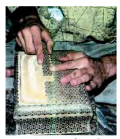
Figure 5. The right side, material collection, manufacturing processes and the types of triangle Khatam strips, Tehran's cultural heritage organization's educational board