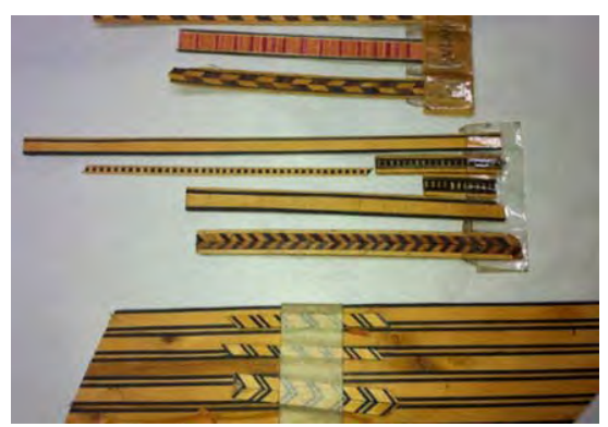
Figures 16 and 15. Three ways of making decorative strips, the left side Figure along with the constructed strips' Figure in the right side