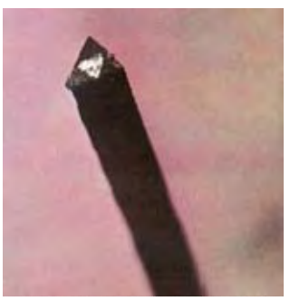
Figure 10. A set of 3 black wooden prism and metallic wire in the middle, which totally makes a blade. (Source: (ibid: 17)