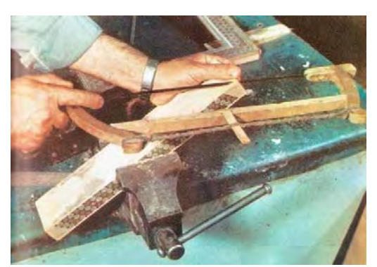
Figure 13. The traditional method of slicing Khatam's Qameh by handsaw (Source: Sattari, 1989: 24)

The next step refers to the coverage of the wooden surface of the desired object by Khatam strips that depending on the utilized location the context or margin Khatam are used. Finally, the entire surface of work is rasped and sanded and eventually all surfaces plastered.