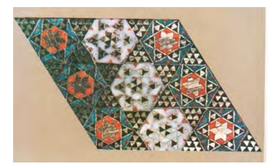
Figure 11. A sample of the motif of Luz Khtama, (Source: ibid: 21)

After Luz formation that is in the form of the long and narrow column with rhombic shape cross section, the column cutting stage becomes complicate about 6 to 8 pieces then these pieces are collected near each other and glued. In the next step, two thin wooden plates are attached under and over the rhombic and two pieces of wood are putted at both ends and first of last rhombic and then are pressed (Figure 12).