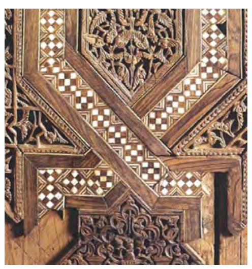
Figure 4. A part of Qutubia pulpit with checkered decoration in the form of isolated sheet in its lower part which indicates its construction method in the form of square inlay not marquetry.