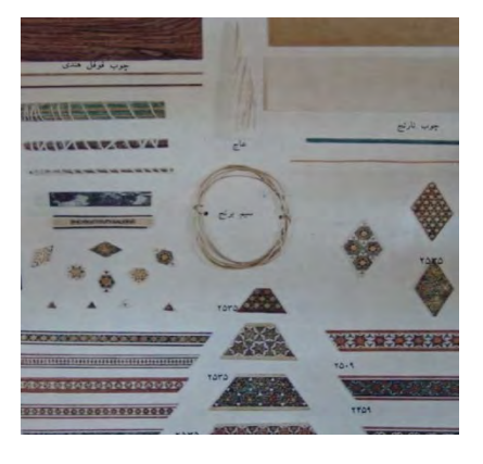
Figure 7. A part of a door of the Qajar era decorated by Khatam with strips contain white rhombic and black margin which is called square Khatam, the Museum of Decorative Arts.