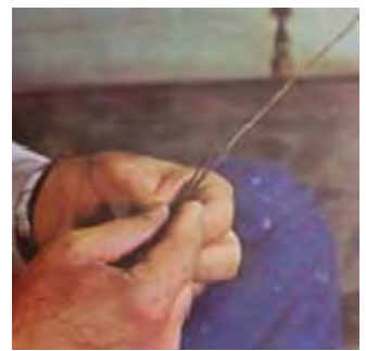
Figure 9. The way of wrapping blade, (Source: Mohammad Sattari, 1989: 16)

Construction method: Several stages are done for Khatam's construction that the first one refers to the Khatam's motif consideration and how to wrap Khatam based on the intended motif. After this stage, the required number of colored sticks and rolled wire are prepared then begin to twist Khatam. Wooden prisms and rolled wires are glued one by one and are attached to each other based on the motif and then yarn is wrapped around it to create Luz Khatam gradually (Figure. 11,10, 9).