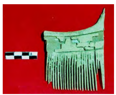
Figure 19. Wooden shoulder of Burnt City of Sistan belonging to three thousand years before Christ, Source: http://shadin.iiiwe.com/city_unknown_amazing_picture

Oxford dictionary defines Inlay as "a design or pattern on a surface made by setting wood or metal into it (Oxford 2011:802)". Collins Dictionary defines this word as "To decorate (an article, esp, of furniture) by inserting pieces of wood, ivory, or metal so that the surfaces are smooth and flat (Collins,1999:388)".