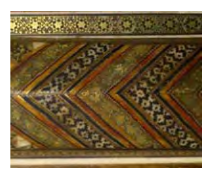
Figure 6. The left side, covering the surface of wooden box by attaching Khatam strips.