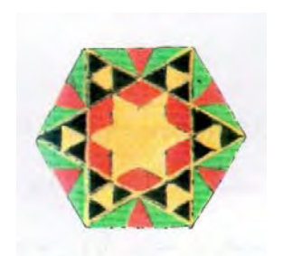
Figure 3. Motifs of a hexagonal Khatam is approximately similar to the hexagonal of Holy book, design of author