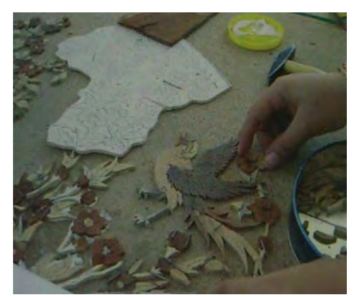
Figure 18. Align the cut pieces near each other on the boards' surface

Features of Marquetry: Although, according to the some dictionary definitions, this art is described as similar to inlay art, this similarity is only in using and picking up different colored pieces together to create a motif on the surface of work and placing in the brought context which is the important feature of inlay, is not necessarily the characteristic of marquetry. (Figure 18)