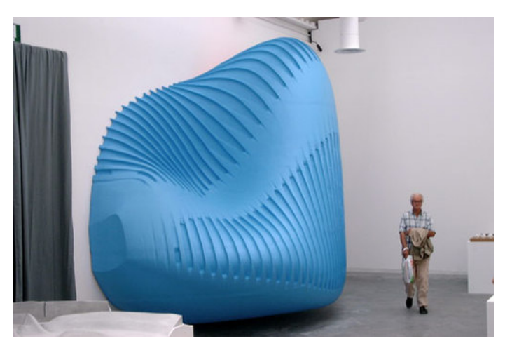
Figure 3. Embryological House

One of the famous works of him is Embryological House. In this concept, he is dealing with diversity, flexibility mass production. In this house, geometrical regulations have been defined perfectly and it proves that proportion, aesthetic, functions in its classic definition are valuable. Not only, does Embryological House influence by preliminary data, also it adapts itself with common local style, climatic condition and material. (Rajabifar, 2009, 97)