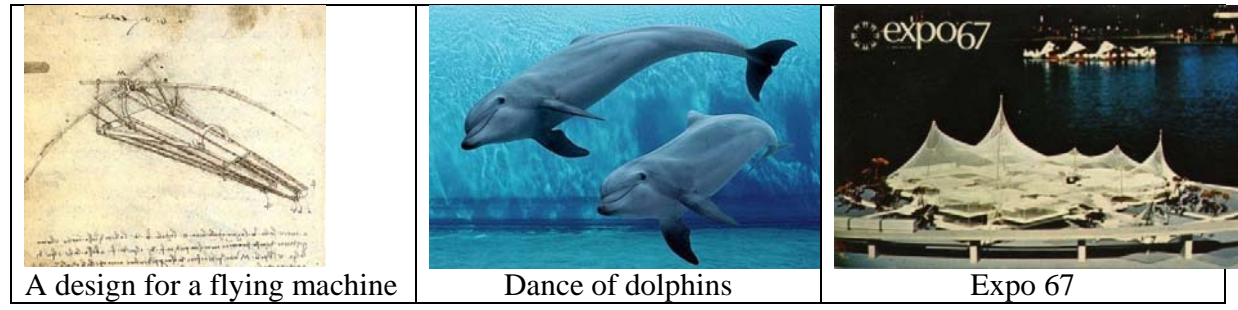
Figure 2. Sample of Bionic Architecture

From the very first, human being was inspired by nature and environment. For example, Leonardo da Vinci, was stimulated by the body of bats in order to make flying machine and the high-speed dolphins were good sources for submarine and even spider's web was applied for Montreal expo by Frei Otto, the German architect (URL: 35).